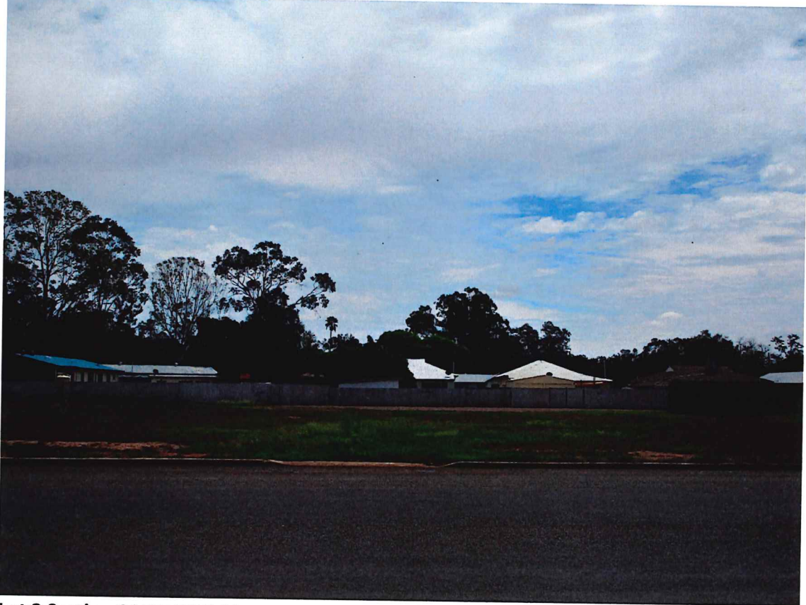
Lot 2 Section 11 DP 758144