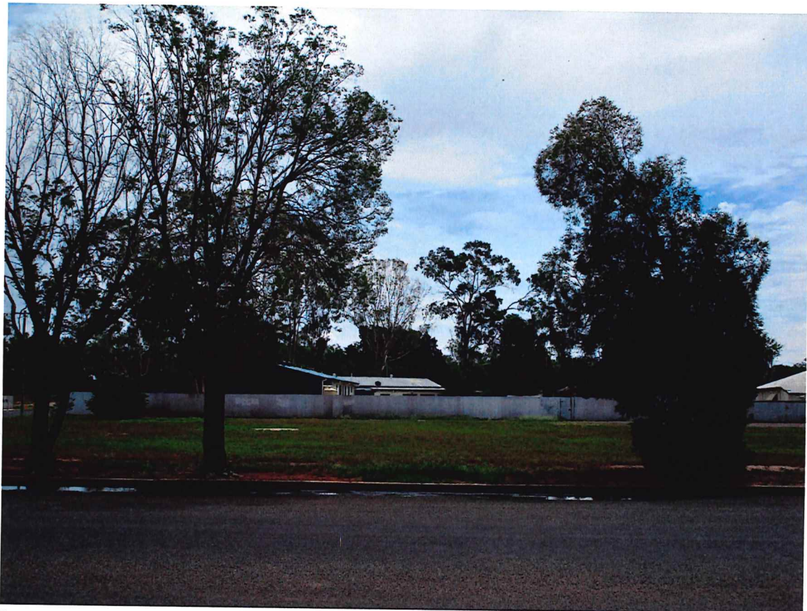
Lot 1 DP 1145233